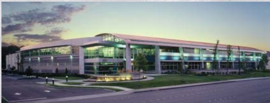
FTI's new 120,000 square foot corporate headquarters and manufacturing plant in Seattle, Washington.